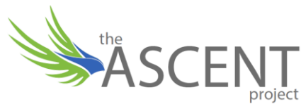
The Ascent Project (Integral)