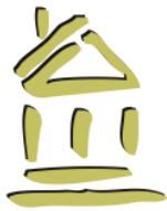
Friends of Boston's Homeless