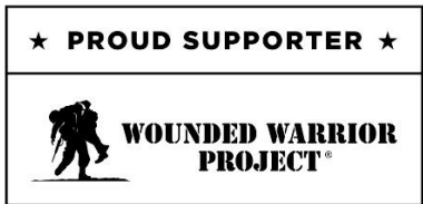
Wounded Warrior Project