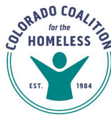
Colorado Coalition for the Homeless