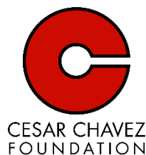
Cesar Chavez Foundation