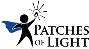
Patches of Light