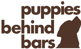
Puppies Behind Bars