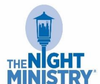
The Night Ministry