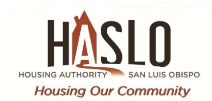
San Luis Obispo Nonprofit Housing Corporation (SLONP)