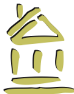
Friends of Boston's Homeless