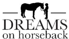
Dreams on Horseback